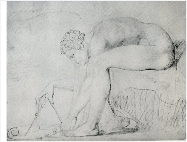
William Blake, Newton