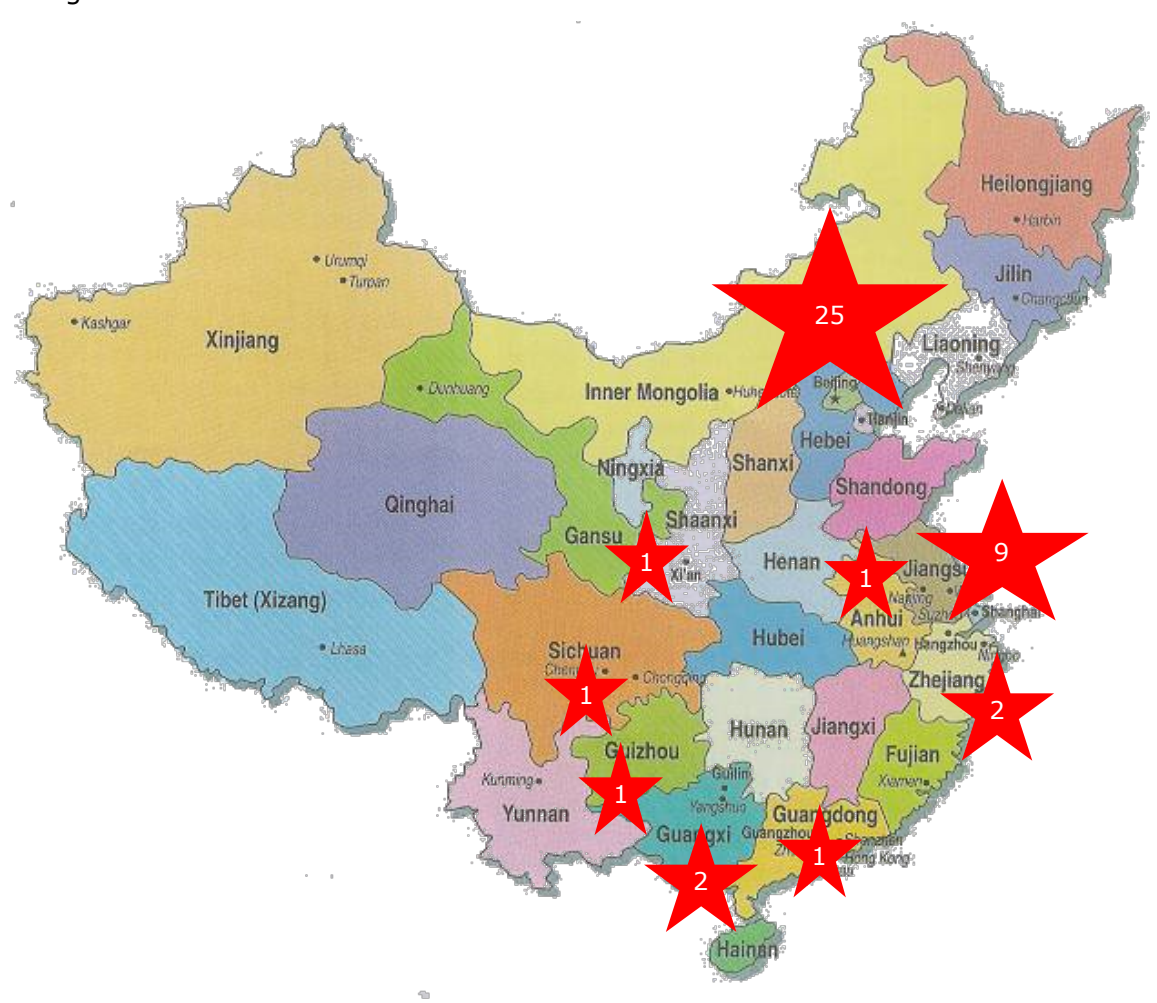
Figure 1 Geographical distribution of former Chinese visiting scholars by number of scholars.

The geographical distribution of the known locations of the scholars listed is indicated in Figure 1.