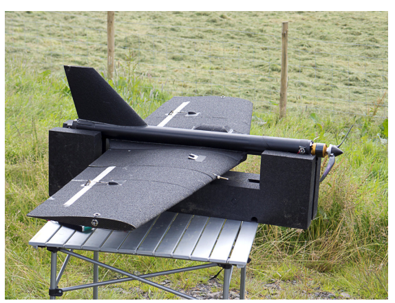
Figure 3. The fixed wing avatar from BlueBear Systems

A major, unexpected, difficulty with the feasibility study was sourcing devices with which to demonstrate the idea of a physical avatar. A range of mobile devices was investigated, ranging from military equipment such General Dynamics' Big Dog and Blue Bear systems iSTART and BlackStart remotely piloted vehicles (RPV), through to various mobile teleconferencing solutions. Most of the military solutions were rejected as too expensive or unavailable for civilian use. Interestingly, most of the, widely advertised, mobile teleconferencing systems were in fact either still at the concept stage or unavailable.