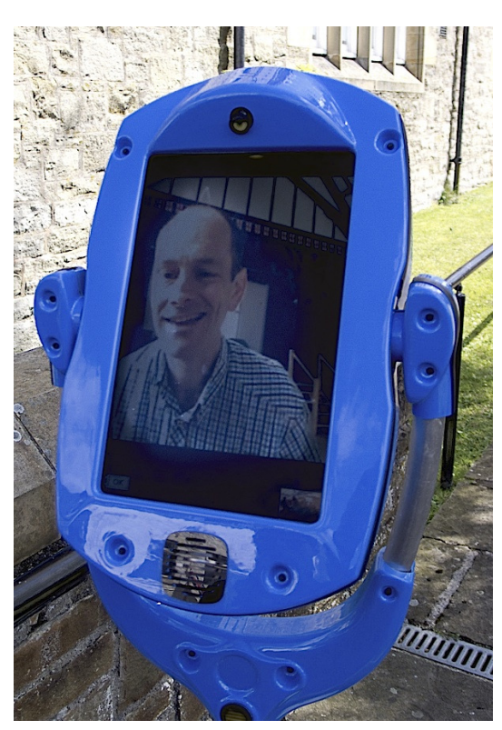
Fig. 4 'Giraff' robot loaned from Advanced Manufacturing Group, University of Warwick