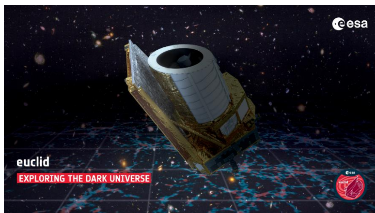
An artist's impression of Euclid.