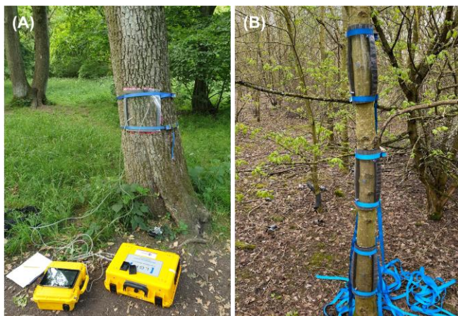
Figure 2 (A) The gas sampling method which used a recirculating closed-loop system between gas flux chambers and a GHG analyser, (B) gas flux chambers affixed to a tree.

This project would involve fieldwork, including measuring CH 4 and N 2 O emissions from tree stems (potentially with a portable GHG analyser and gas flux chambers as shown in Figure 2). This technique can be used to measure GHG fluxes from trees in situ .