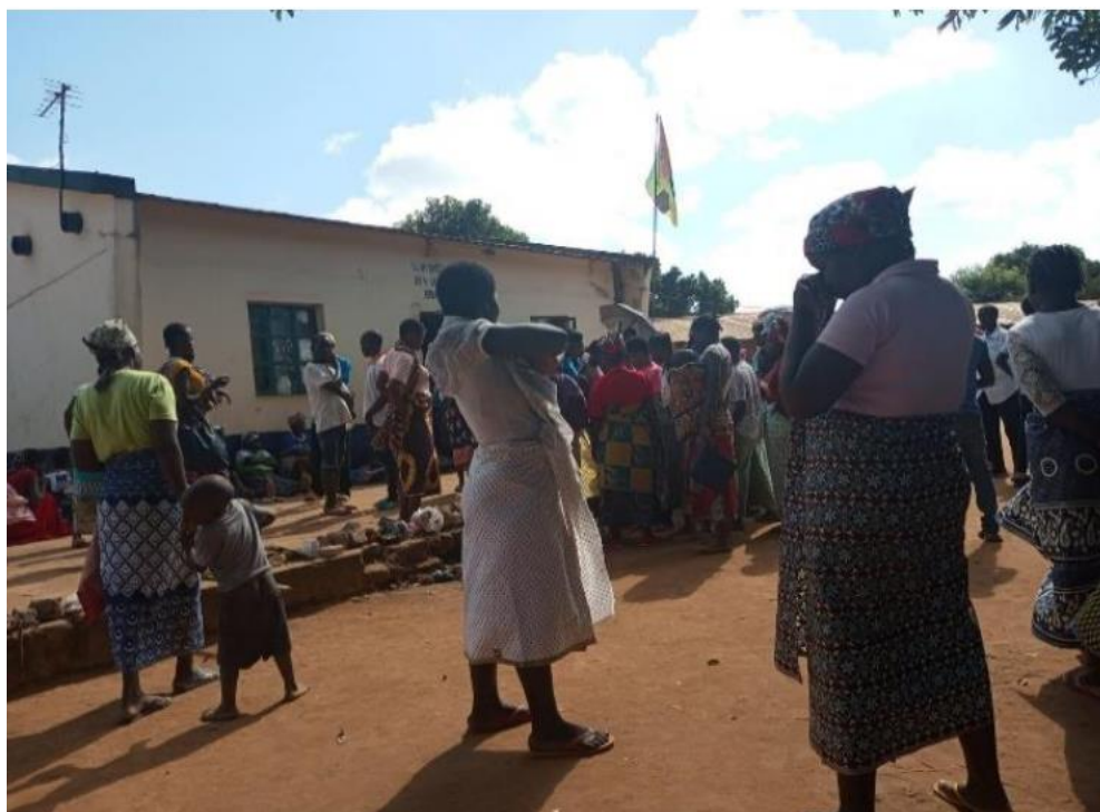
Unattended queue at Pista Velha.

The letter adds that the instruction comes from the branches and circles of the party to facilitate obtaining and controlling data on the voters. And the students say they are being threatened with expulsion from the college, if they do not vote for Frelimo.