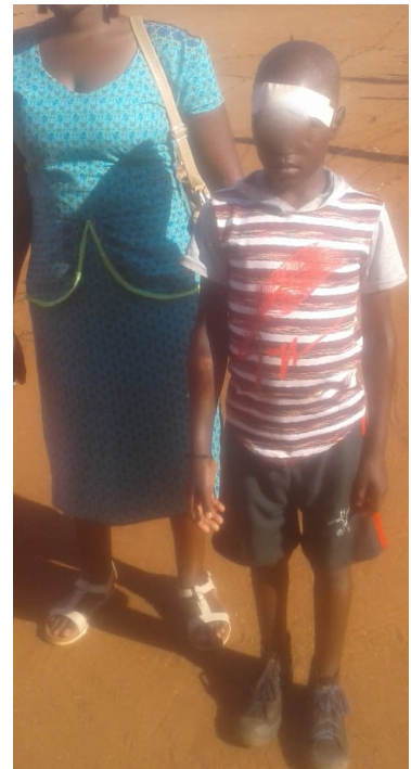
Child who was on the lorry and was injured, outside hospital with his mother

Most of the deaths and injuries in this this election campaign have been due to traffic accidents, and Frelimo, in particular, has been plagued by road deaths. After seven people were killed and 50 injured when a packed truck overturned returning from a Nyusi rally in Songo, Tete, on 22 September, Filipe Nyusi has repeatedly said that people are not being transported to his rallies to boost the crowds. But it is clearly still happening