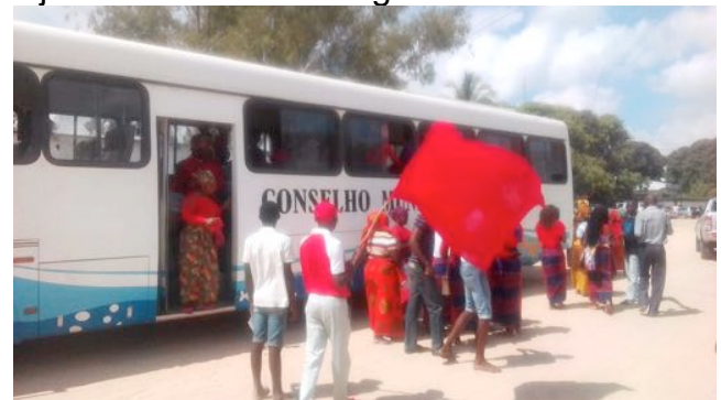
Nacala municipal bus carrying Frelimo supporters to a rally yesterday.

The second and third days of the campaign again saw Frelimo improperly using government resources.