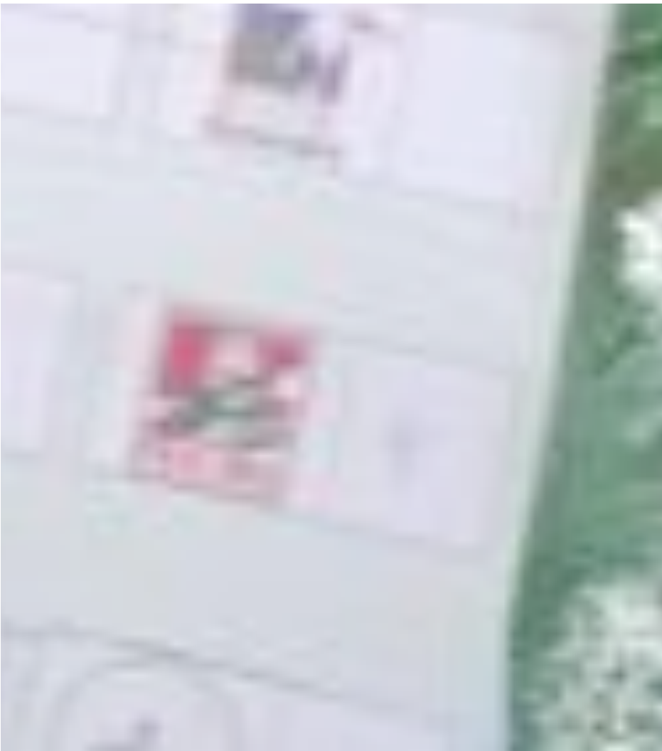
Pre-marked ballot papers found in Chidenguele, Gaza